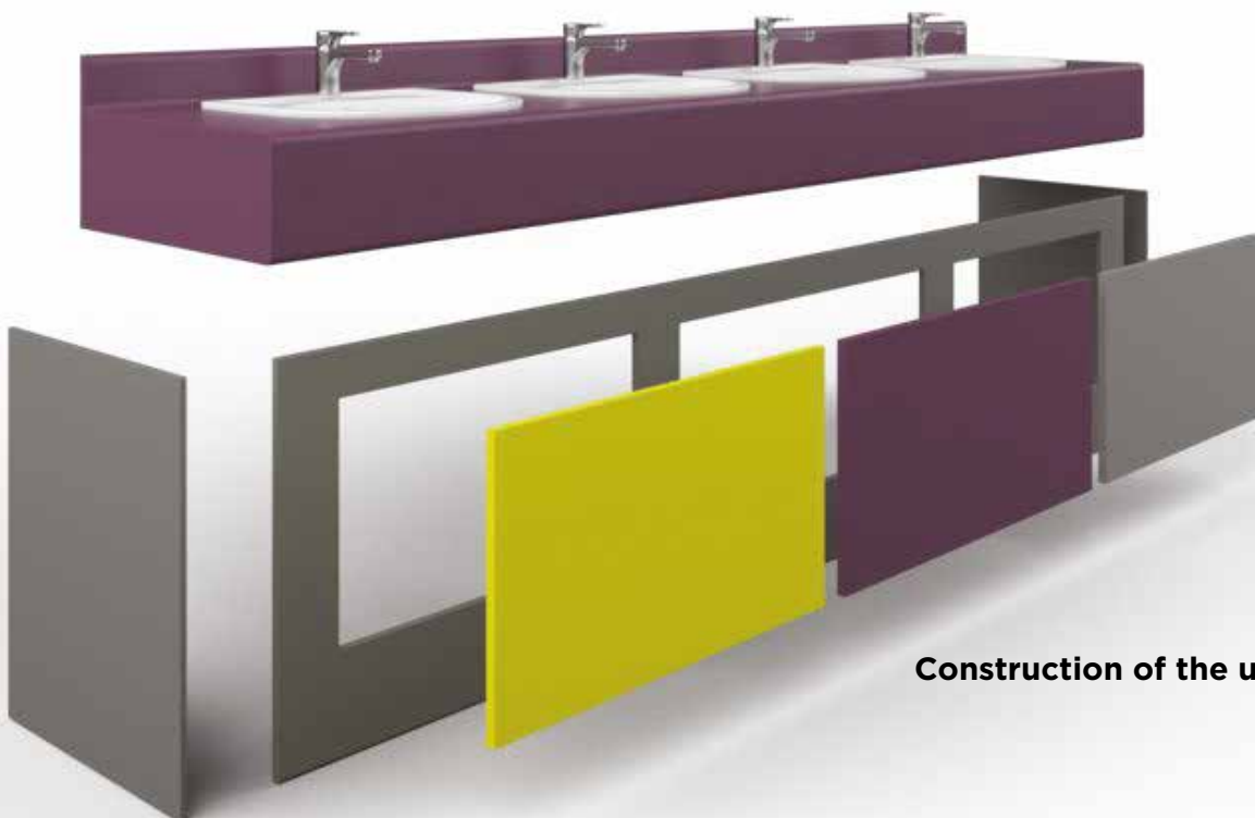
Construction of the units