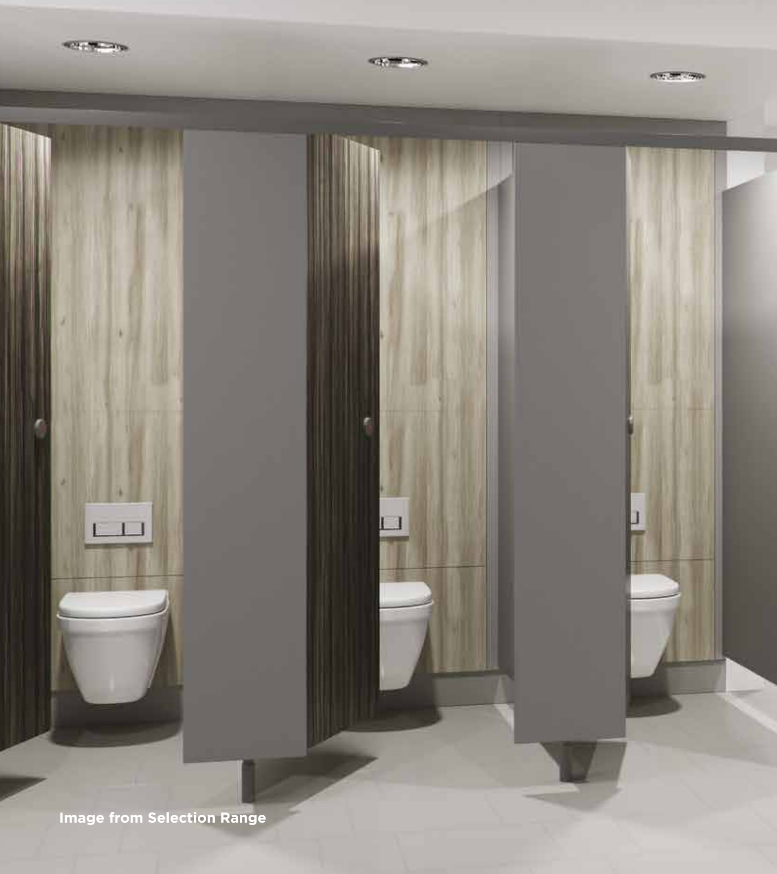
Image from Selection Range