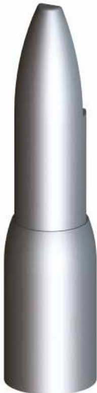
L12 Partition Support Leg