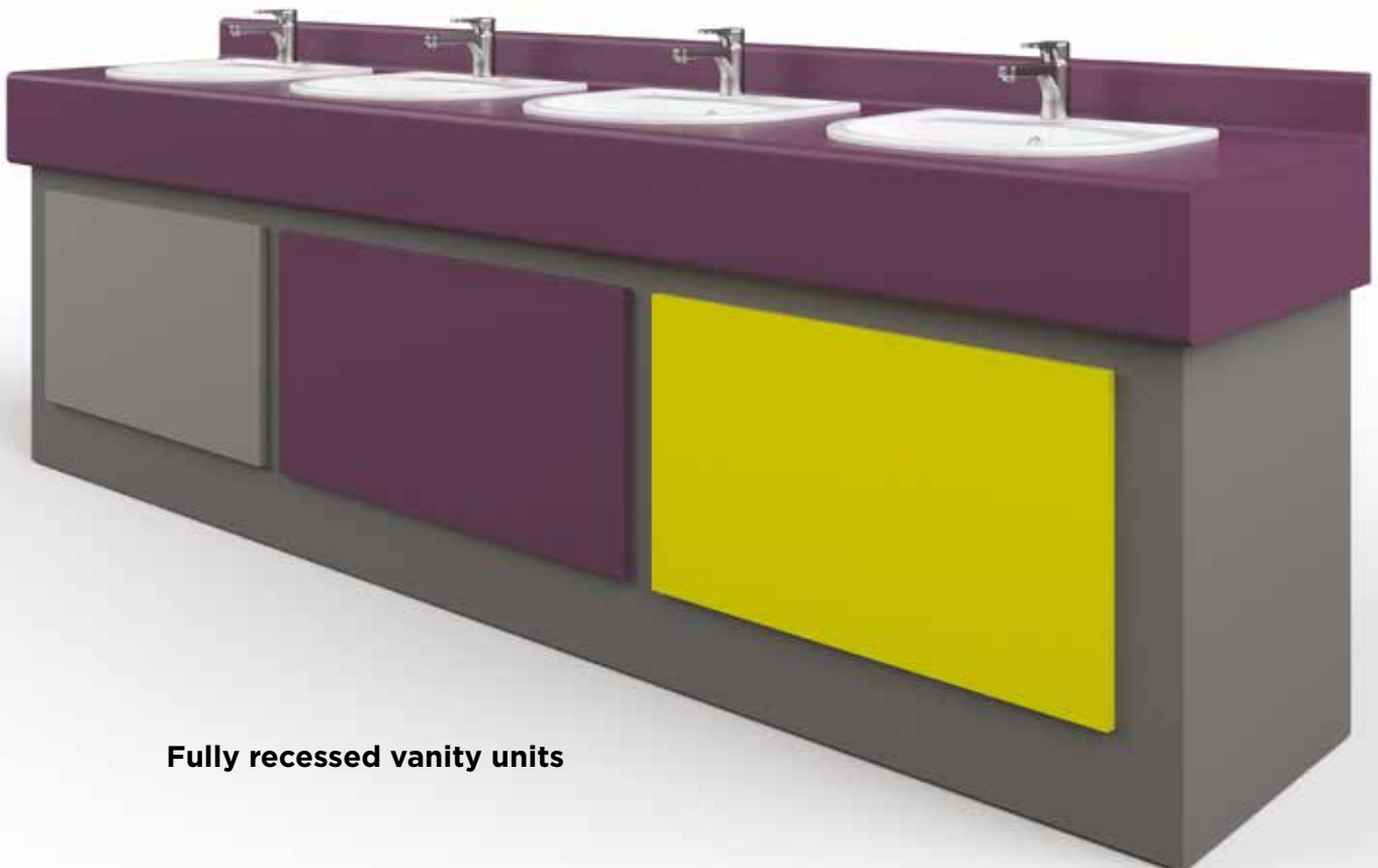
Fully recessed vanity units