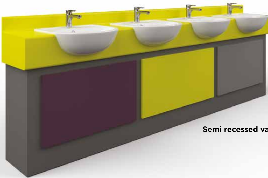
Semi recessed vanity units