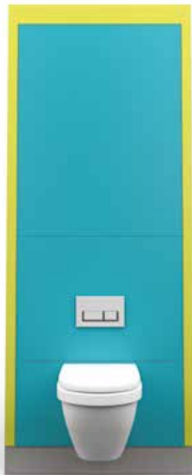
WC Integrated Panel System